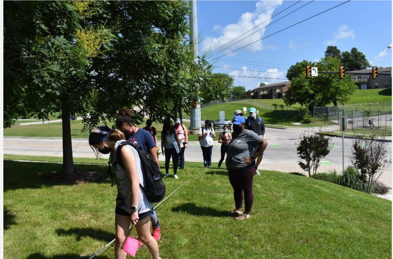
WALKING THE FIRST TRANSECT LINE